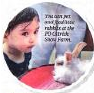
You can pet and feed little rabbits at the PD Ostrich Show Farm.