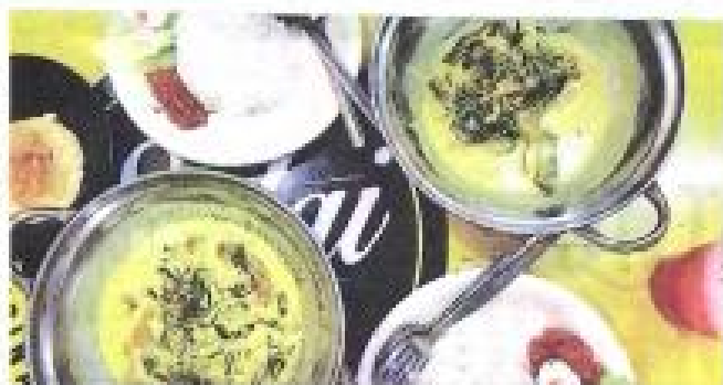
Wawang Satei claims to serve the original 'Melayan' recipes.

The next day, Ricki and I decide to try out another local favourite dining place called Wawang Satei.