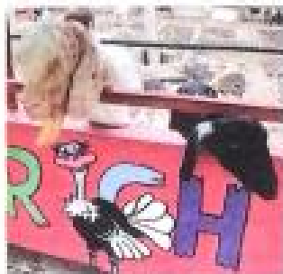
A handover feeding goat at the PD Ostrich Show Farm.

There are goats, chickens, cows, rabbits and many more. Older kids can also try riding a pony.