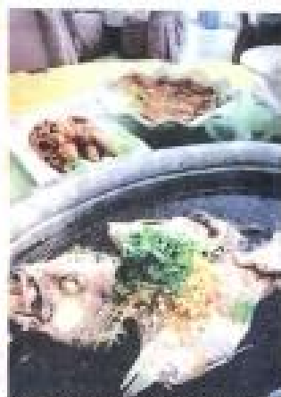
The Sri Pantai Ria Seafood Restaurant serves daily fresh catches at affordable prices.