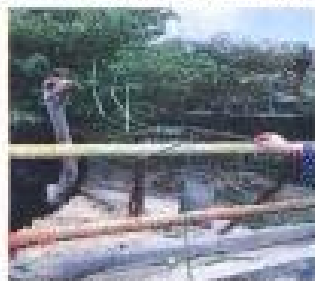
Feeding the ostriches is a fun activity at the PD Ostrich Show Farm.

On the ground, there is also a dinosaur park, ideal for curious kids who love a Jurassic adventure.