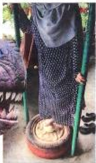
Stepping on the hard ostrich egg.

The dish is served in a small kasul (bowl) and the portion is just nice for one person. If you go there in a group, I highly recommend ordering different dishes on the menu to share and enjoy all.