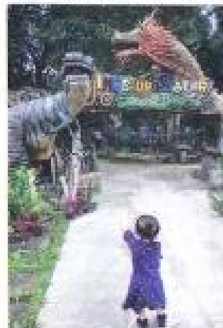
Kids will enjoy the Dinosaur Park.