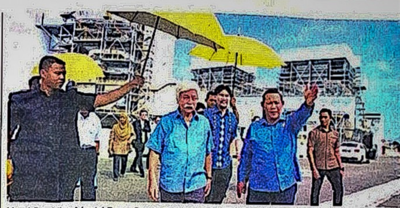
Negri Sembilan Mentri Besar Datuk Seri Aminuddin Harun (second from right) accompanyin Yang di-Pertuan Besar of Negri Sembilan Tuanku Muhriz Tuanku Munawir on a tour of the RM12bil Tuanku Muhriz Power Station in Jimah near Port Dickson which will be able to produce 2,000 megawatts of electricity, enough to supply two million households in the peninsula.

The number of households registered under the programme in 2017 was 2,328 and this declined to 2 150 in 2018